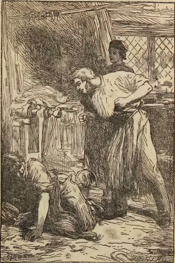
OLD ORLICK AMONG THE CINDERS.